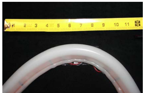
Out of plane bend - 6" radius or greater