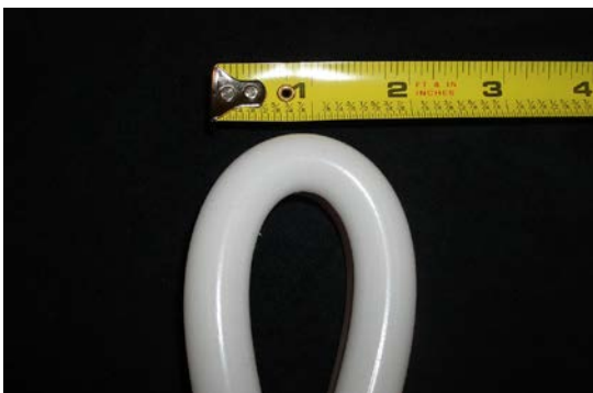
In plane bend as small as 1"

CAUTION! Bending FlexiBRITE tighter than a 6" radius out of plane, twisting FlexiBRITE or stretching FlexiBRITE can damage the lighting circuit board and cause non-warranty failure.