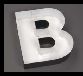
on the backs and returns of your channel letters...