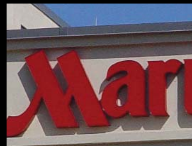
MAXX-Brite® The Brilliant Choice!