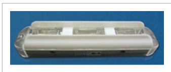
FlareShield™ on module