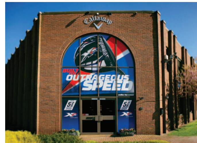
Contra Vision® Performance ™ external view

Contra Vision® Performance ™ is our premium brand of perforated window films made from high-performance, thick polymeric calendered face films. The product range is manufactured to exacting standards to provide high quality printing, minimal shrinkage and problem-free installation and removal.