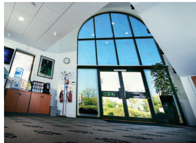
Contra Vision® Performance ™ internal view out

We recommend Contra Vision® Performance ™ white on black perforated window films for use on longer term applications, vehicle graphics and any other arduous applications, and where speed of removal is important, for example on building wraps. The thickness and durability of our polymeric vinyl formulation means that an overlamine is only needed in locations where the graphics will be exposed to rain and/or dirt where constant through-vision is an essential requirement or in situations where the films are exposed to abrasion or chemical washing.