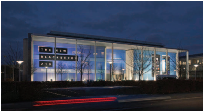
BlackBerry Headquarters wrapped in Contra Vision® Performance ™, UK