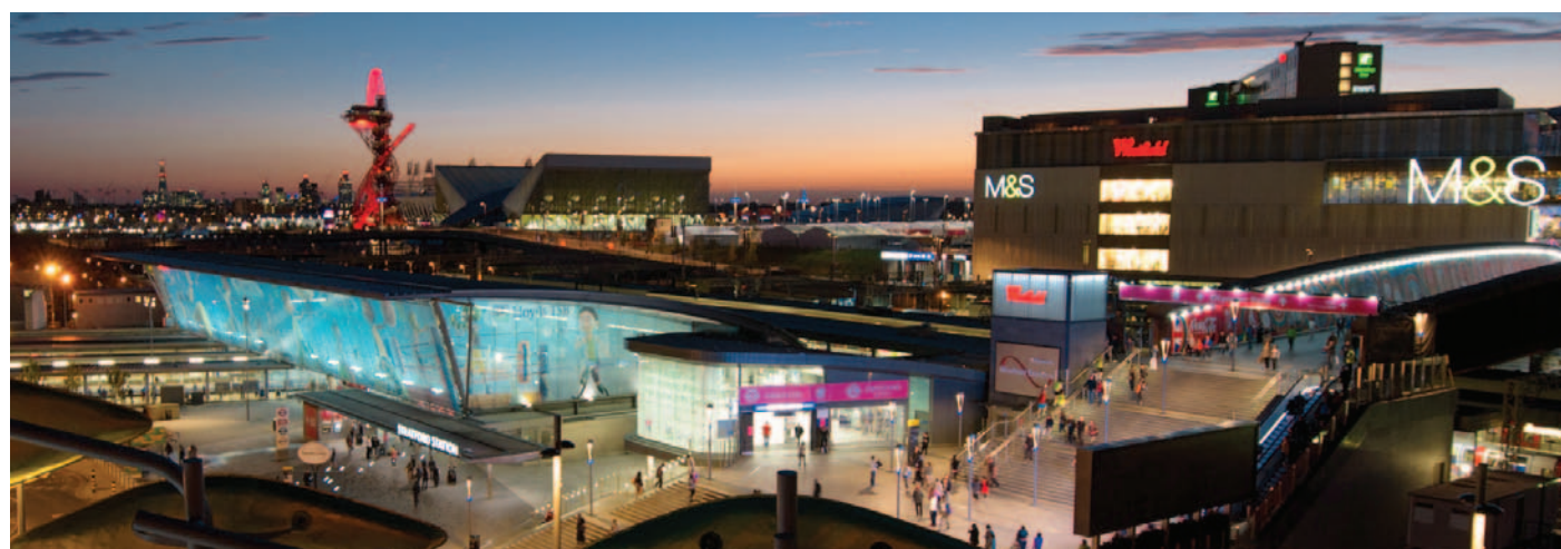
Contra Vision® BACKLITE™ night-time view

Contra Vision® Translucent White Perforated Window Film enables see-through graphics to be illuminated at night using (back) lighting from inside the window. This overcomes a problem faced by conventional (white on black) perforated window film, which suffers from image fading and becomes transparent if the inside is illuminated at night.