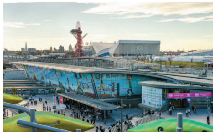
Contra Vision® BACKLITE™ daytime view