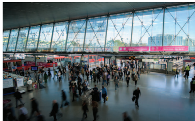
Contra Vision® BACKLITE™ internal view out