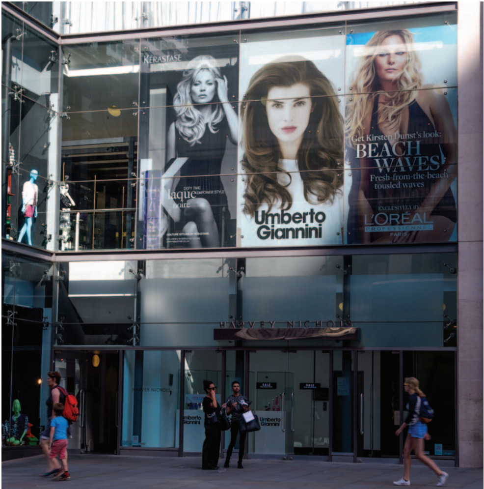
Access to the inside of glazing is often easier than to the outside

Please contact your local supplier for availability of roll lengths and widths, liner types and transparencies.