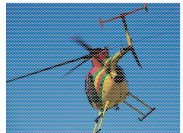
Same printed graphic with Contra Vision® Grayliner ™

It avoids the “washed out” appearance of prints on a white liner and deters the use of excessive, wasteful amounts of ink that can damage the performance of perforated window films. It also helps to showcase the printed image in the best possible way, increasing the likelihood that test prints are accepted and reducing the likelihood that final prints are rejected prior to installation.