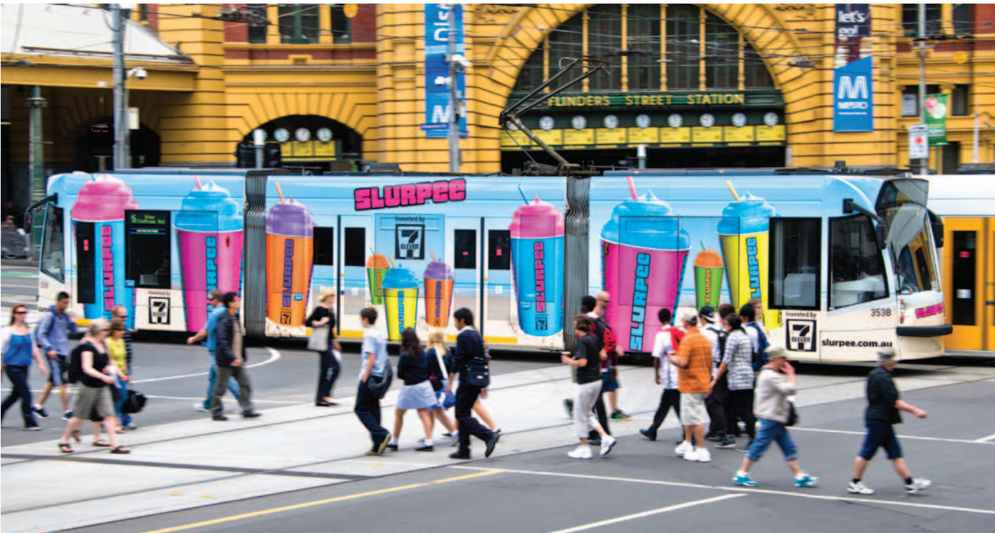
The Contra Vision® range of perforated window films is available from:

Please contact your local supplier for availability of roll lengths and widths, liner types and transparencies. Please visit www.contravision.com for more in-depth product and technical information