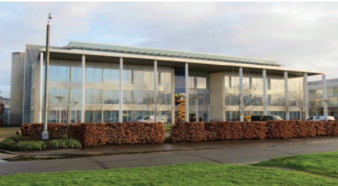
BlackBerry Headquarters before branding, UK

We are delighted to offer our know-how and experience to printers and specifiers to ensure optimal product specification and the best results.