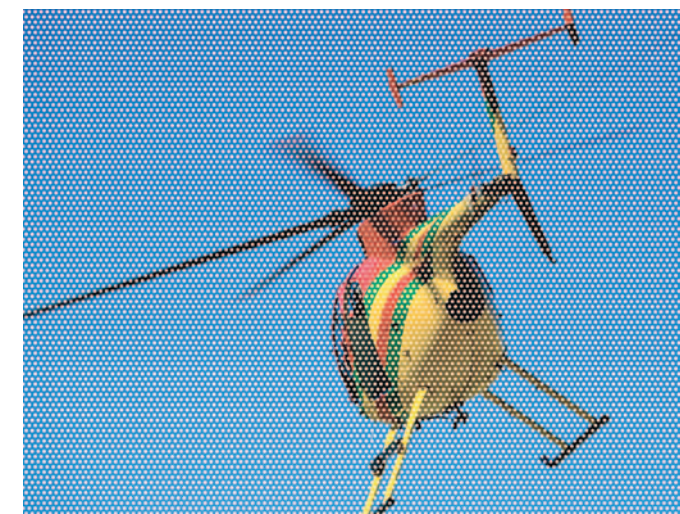
Printed graphic with traditional white liner

Contra Vision® Performance ™ and Contra Vision® Campaign ™ both feature Contra Vision® Grayliner ™ , a major patented improvement to perforated window films. These window films come with a grey coloured liner instead of the traditional white or clear varieties. The grey colour visible through the perforated holes gives a more accurate representation of how the printed image will look on a window.